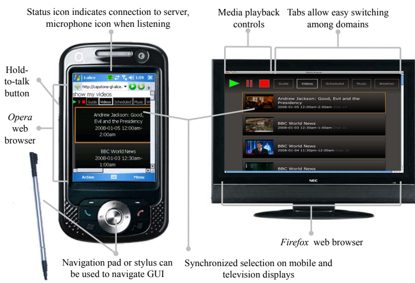
Figure 1: User interface overview.