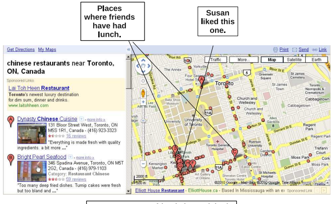
Restaurants your friends have visited

It is several months later. A friend of the original reviewer is now in Toronto, looking for a place to have lunch. He logs onto the same website, navigates to the Toronto page, and sees a list of reviewed sites. He has shared information himself with his friends and the system has learned that he and our original reviewer have similar tastes. The Chinese restaurant fits perfectly into the profile for both users, and is highlighted (see Figure 4) in the results.