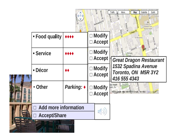
Figure 3: A representation of the user interface for reviewing, accepting, and sharing content.

In Section 2, we describe the current state of the art in the technologies to be used for acquiring content via speech. Section 3 describes recent research in recommender systems and user modelling and shows how content collected via a mobile device fits into the emerging paradigms in these fields.