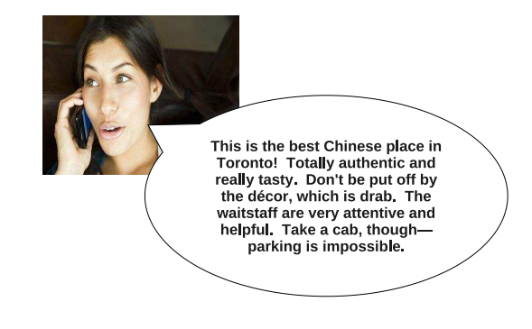
Figure 1: A representation of how a user might create content via speech.

The scenario we describe above is the first-stage interaction with an overall system that uses speech for content creation, social media, and recommender systems. In subsequent sections, we will enlarge upon this scenario, with fur-